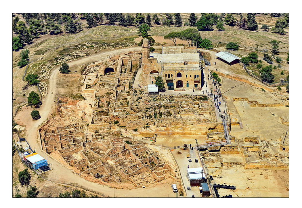
Nabi Samuel (2014). 103

The situation drastically changed after 1967, when the Israeli army had seized the territory of Nabi Samuel. In 1971, the previous inhabitants were displaced, and a national park was established around the mosque, with a place of prayer for Jews within the mosque itself, and a synagogue arranged in the burial crypt. A somewhat forgotten sanctuary began to incite emotions anew. Due to the archaeological works and the first Hebrew publications relating to this place, its importance not only or not so much for religion, but also for the history of Jews and Judaism was recognised. Protesting against the actions of Israel, Muslims started to arrive at this place increasingly often.