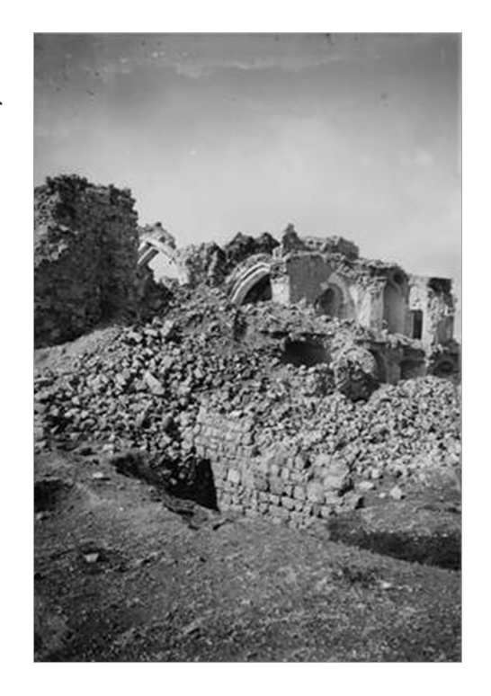
War view of Nabi Samuel. Ruined mosque 1917 or 1918.<sup>101</sup>

Two significant battles were fought for the control of that hill in the 20th century. The first battle, between the Ottoman Turks and the British army, was waged in 1917.<sup>99</sup> It was during these battles that Nabi Samuel Hill was heavily bombed, resulting in severe damage not only to the Arab village, but also to the remains of the Crusades times.<sup>100</sup> Nabi Samuel was attacked for the second time in April 1948, when a detach-